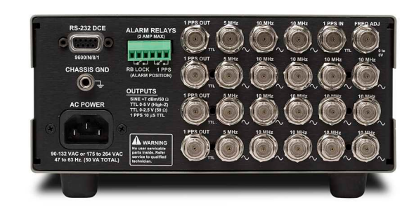
FS725 rear panel (with Opt. 03)

FS725 Benchtop Rb frequency standard $2795 Option 01 Distribution amplifier (6 outputs) $495 Option 02 Distribution amplifier (12 outputs) $995 Option 03 Distribution amplifier (18 outputs) $1495 O725RMD Double rack mount kit $100 O725RMS Single rack mount kit $100